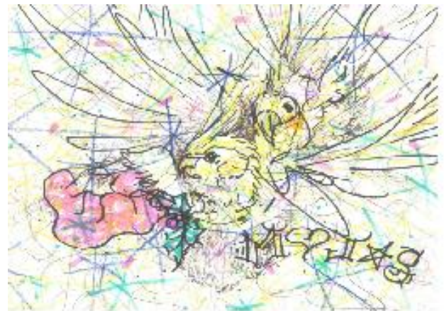
Picture depicting Mojo and Mojita, the WNYVHC's cockatiels during the holiday season.