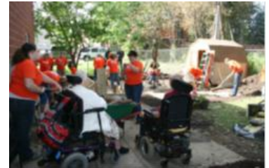
9/11 Service Day