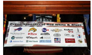
Red, White, and Blues