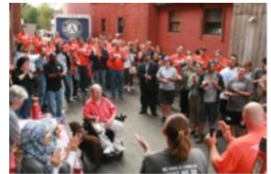
9/11 Service Day