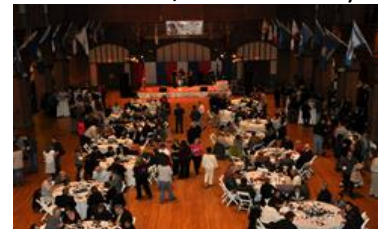
Red, White, and Blues